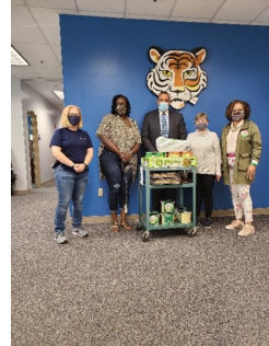
Desserts and sides were provided by to MLMS to go with the